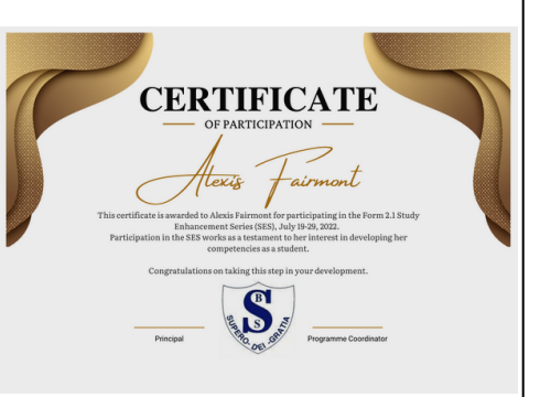
Certificate received by each participant

It is intriguing to listen students' feedback and to hear their thoughts. This experience did not skip over the voices of the students and it was enlightening to hear how they perceived the 2-week encounter. Table 1 indicates some of the questions they were asked and how they responded to those questions. Thirteen students attended the series, but the responses reflect the thoughts of 7 of the 9 available to complete the survey on the final day of the workshop. While these questions and feedback may not qualify as official research data, they do provide us with a window for understanding our students' needs and desires.