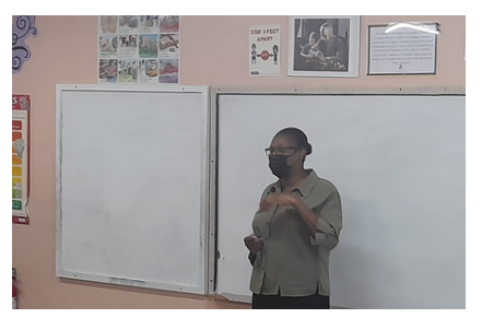
Principal giving opening remarks