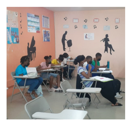
Participants working on study skills