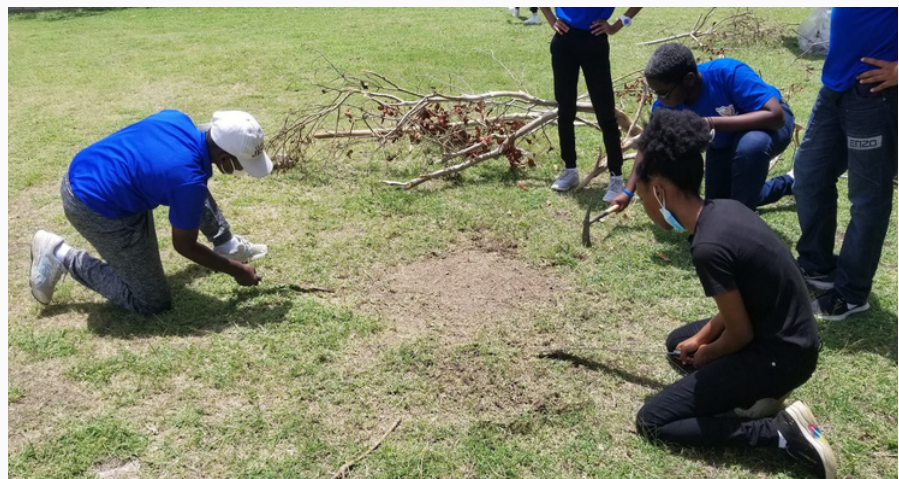
Preparing for fire building and camp cooking

There are lessons that cannot be taught more clearly than through the outdoor experience. It is important that children, from an early age, be placed in the wonderful "lesson book" of nature.