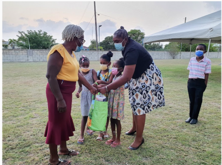
Adventurers presenting a food hamper to the Community Service Department

To serve requires one's own strength but being called to serve requires being intentional in submitting to GOD. It involves surrendering all to the total control of the Holy Spirit to guide in fulfilling one's purpose in this life, having daily, constant, intense prayer, and not leaning one's own understanding.