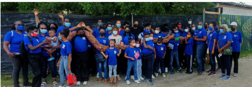
Visit to Marizayra Nature Sanctuary